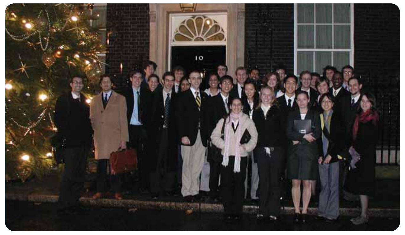
Marshall Scholars on their visit to 10 Downing Street