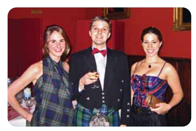
Celebrating Burns Night

I have conducted my work in accordance with Bulletin 1999/6 "The auditor's statement on the summary financial statement" issued by the Auditing Practices Board for use in the United Kingdom. My report on the Commission's full annual financial statements describes the basis of my audit opinion on those financial statements.