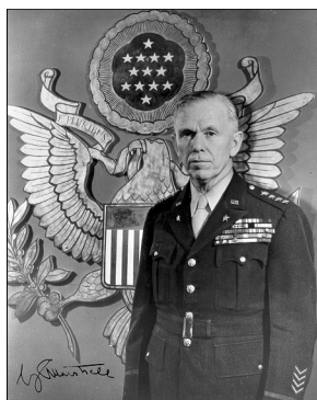
General George C. Marshall, instigator of the European Recovery Programme (Marshall Plan)

As a way of expressing Britain's gratitude to the American people for the Marshall Plan, the British Parliament passed the Marshall Aid Commemoration Act in 1953 which founded the British Marshall Scholarships.