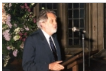
Lord Putnam of Queensgate, special guest and speaker at the Marshall Dinner